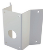
GBR-CM01 Corner Mount Adapter