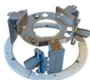
GBR-IC01 Ceiling Flush Mount Adapter