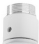
GBR-AM02 Adapter Ring for Pelco Pendant Mount with 1,5" NPT thread